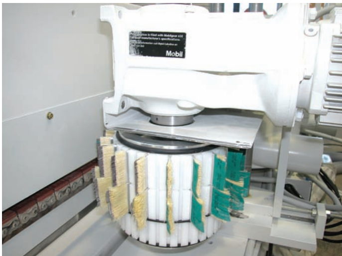
Close-up of the multi stage Flex Trim head.